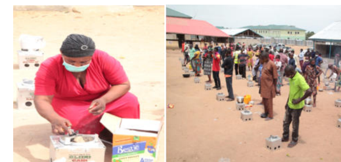
IDP woman lighting up the fabricated cooking stove using rice husks

Consequently, CLHEI donated 60 fabricated stoves to 60 IDP households living in Abagena IDP camp in Makurdi LGA of Benue State.