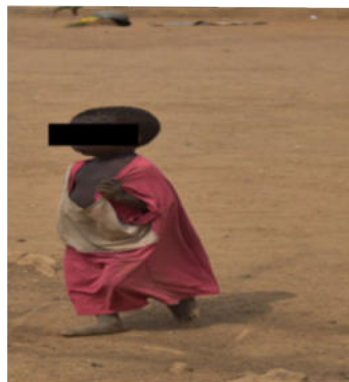
Tomna walking across the camp to locate his mum