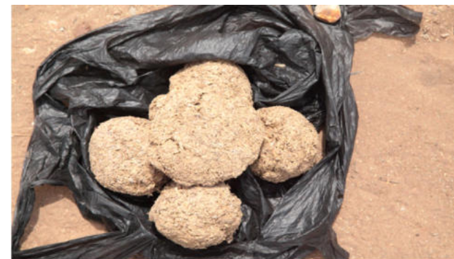
Rice husks recycled through the use of local binders as alternative cooking fuel

This was borne out of the idea to reduce total dependence on firewood with its daunting effect on the environment, the challenges encountered by the IDPs in the search of firewood for cooking in far away hinterlands around the host community, as well as the potential to recycle rice husks through the use of local binders to mould briquettes which will serve as alternative cooking fuel for IDPs.