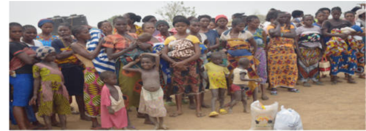
A group of lactating mothers looking as the stage is been set for the 2021 Christmas Kitchen distribution at the Ortese IDP Camp in Guma LGA, Benue State