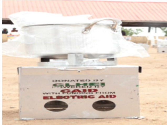
Fabricated cooking stoves and cooking pots for 60 IDP households at Abagena IDP Camp in Benue State

through our Humanitarian response and Disaster management thematic area, In response to the challenges faced by IDPs around the use of firewood for cooking and to further contribute in the advocacy for the reduction in deforestation and felling of trees with its attendant effect on climate change and greenhouse effects, CLHEI initiated the idea of locally fabricated stoves that will utilize rice husks as the basic source of cooking fuel.