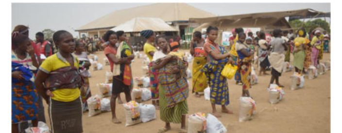
A cross-section of beneficiaries standing beside their items received during the 2021 Christmas Kitchen distribution at the Ortese IDP Camp in Benue State