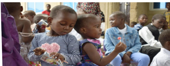
Children sharing gift-items in love during the Children's Day Celebration