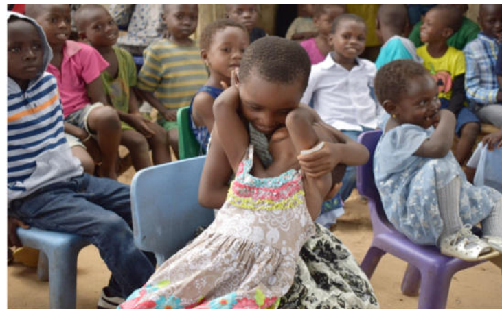
Children enjoying their moments during the Children's Day Celebration