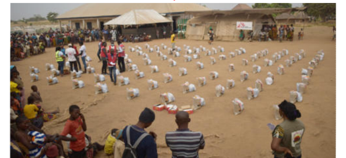
Arrangement of items for distribution by the CLHEI Christmas Kitchen Team during the 2021 Christmas Kitchen Activity in Ortese IDP Camp, Guma LGA of Benue State