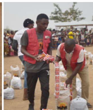
Christmas kitchen team arranging items for distribution flanked by beneficiaries