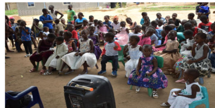
A cross-section of children at the NEPA Quarters IDP Camp during the Children's Day Celebration