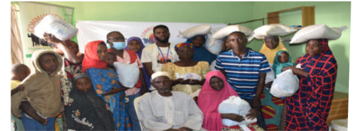
A group photo of CLHEI Team & beneficiaries drawn from Awe, Tudun-Kaure, Obi & Wamba Communities during the 2021 Christmas Kitchen distribution in Lafia, Nasarawa State