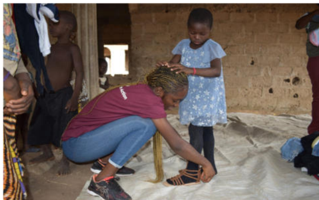
Volunteer dressing up a girl in preparation for fashion parade during the Children's Day Celebration